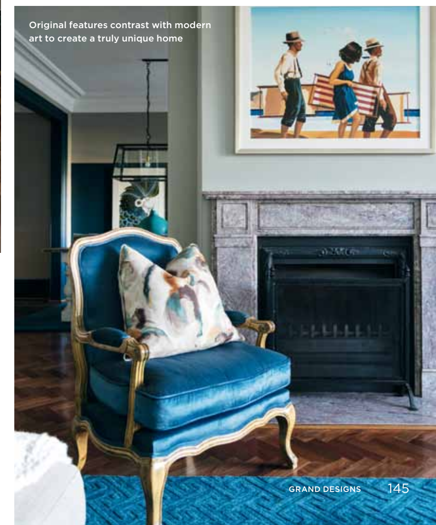
Original features contrast with modern art to create a truly unique home

WORDS // ANNABELLE CLOROS