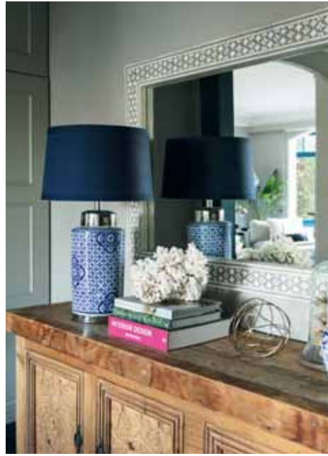
LEFT Natural wood furniture features prominently FAR LEFT Guest bedrooms give a gentle nod to the seaside locale via artwork and soft furnishings