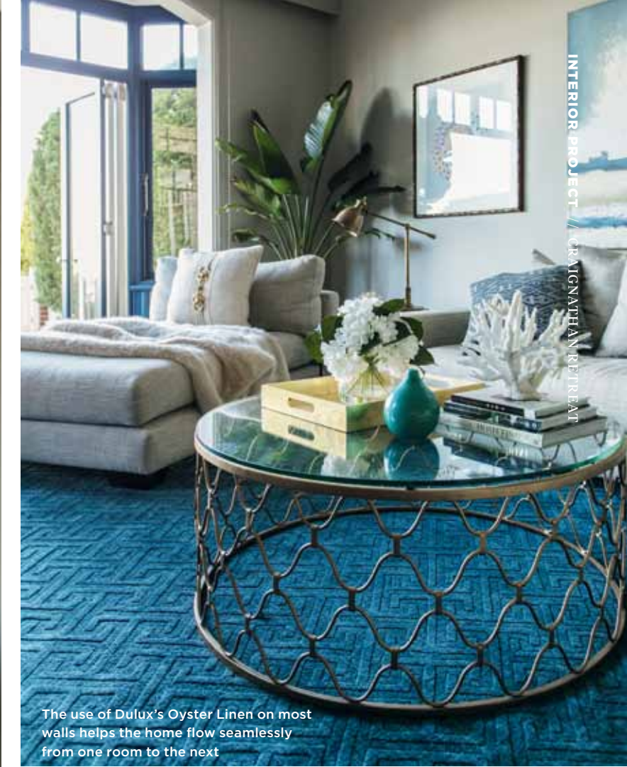
The use of Dulux's Oyster Linen on most walls helps the home flow seamlessly from one room to the next