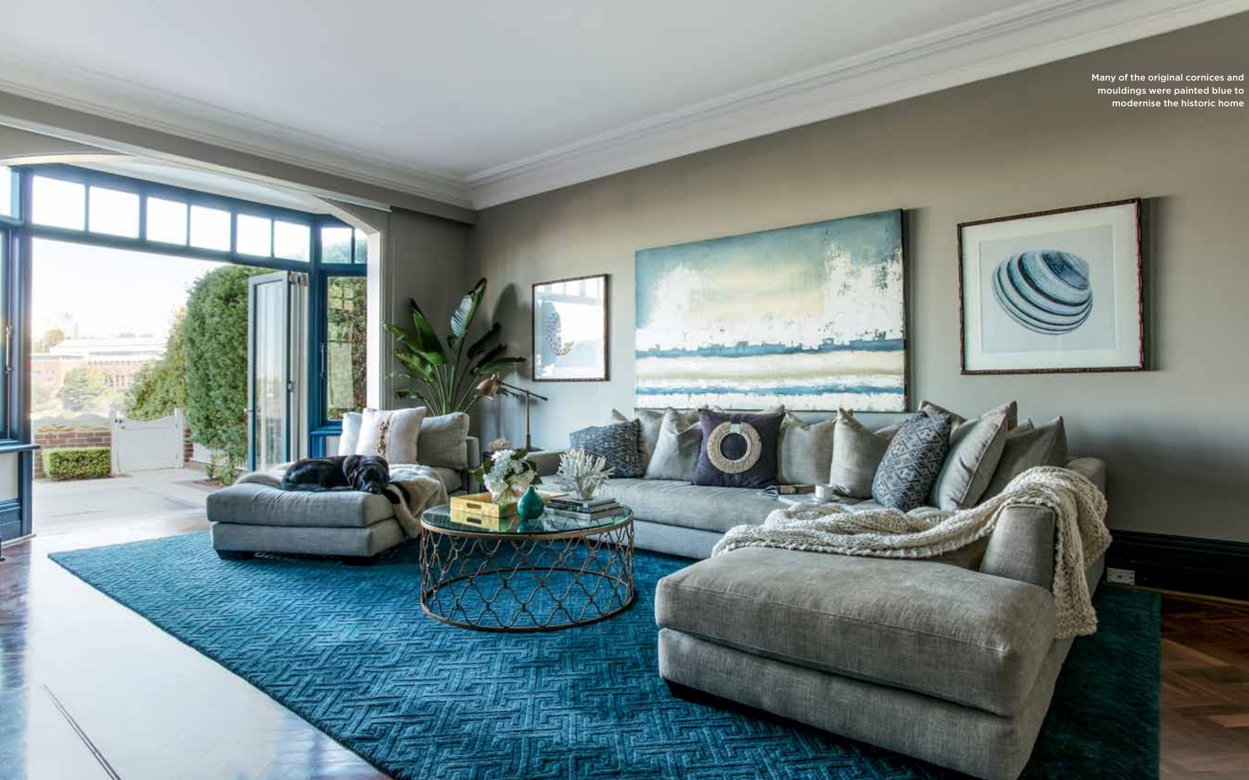
Many of the original cornices and mouldings were painted blue to modernise the historic home